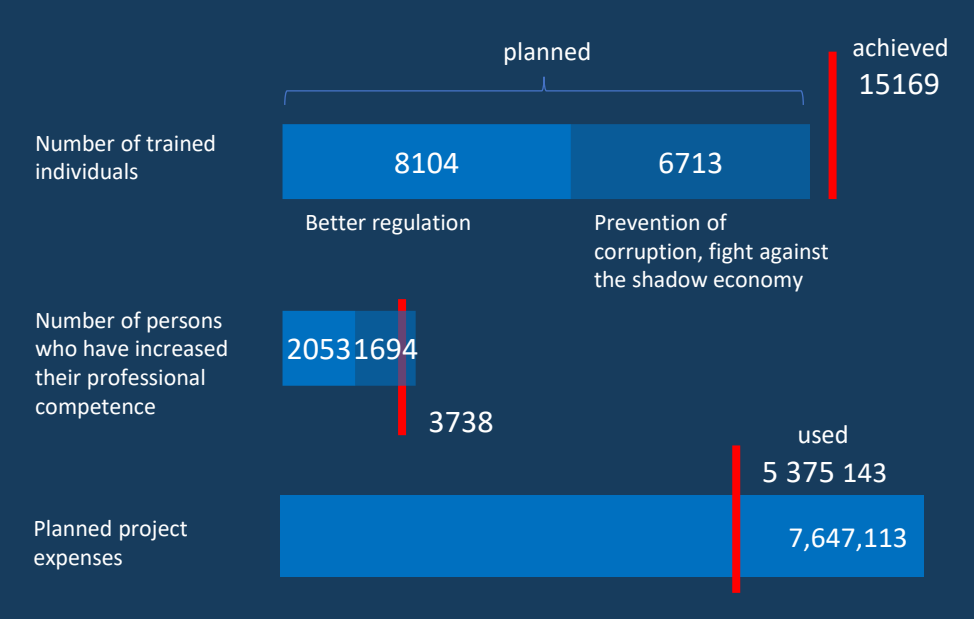
Figure No. 2. Outcome and result indicators achieved within the measure

Outcome and result indicators achieved within the Measure: